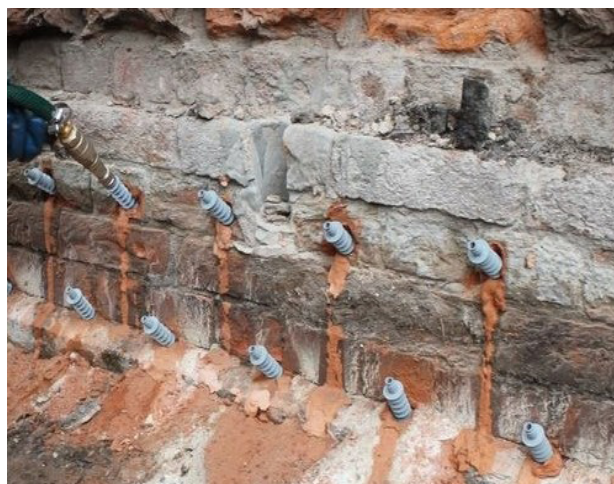
Figure 6. Masonry injection

As for the internal structure, to adapt the ancient structure to modern standards of safety and essential