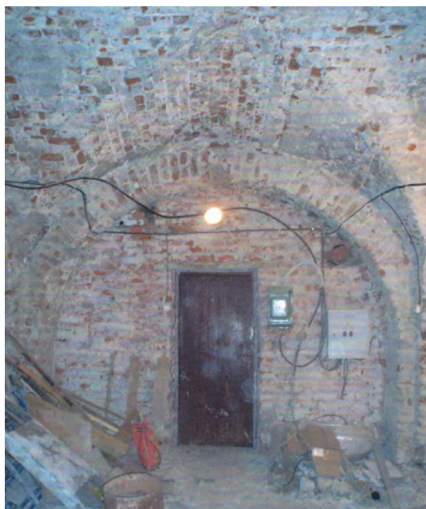
Figure 4. Condition of the interior walls. Photos, 2010