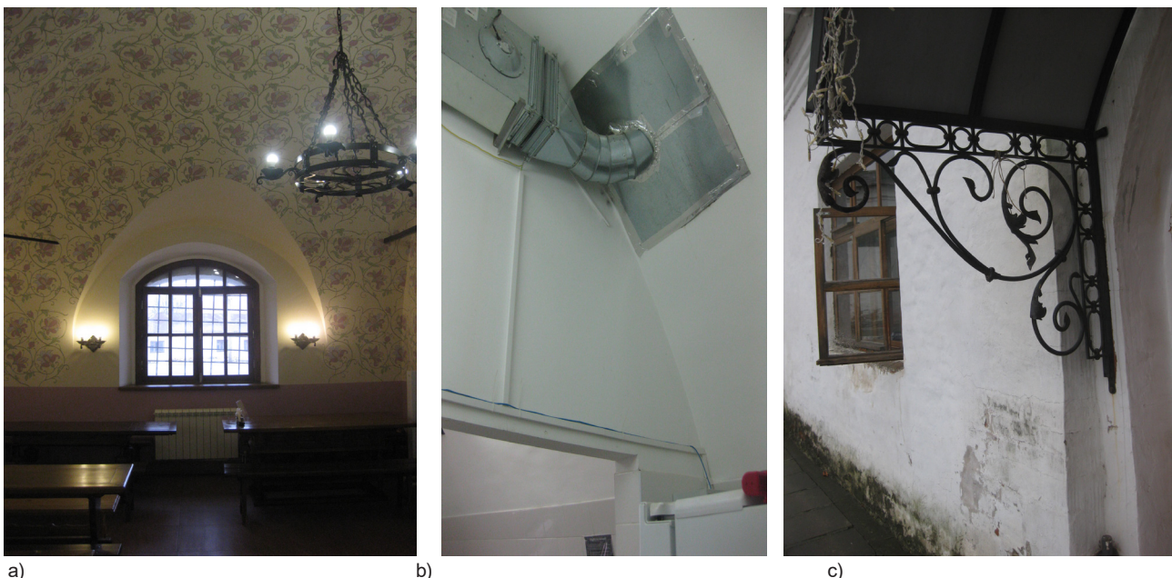
Figure 7. Household Building (late 17 th century, 19 th century). Current state. November 19, 2021 a — the interior of the dining room, b — the ventilation duct, c — the canopy

Due to the wide variety of options used to adapt cultural heritage sites, cities are turning into tourist attractions with a developed economy and unique architectural environments. Each monument contributes to the historical appearance of the city, encouraging people to get to know their culture and history. The site under consideration, located on the Ryazan land, can become another protected place that will attract those who value cultural heritage.