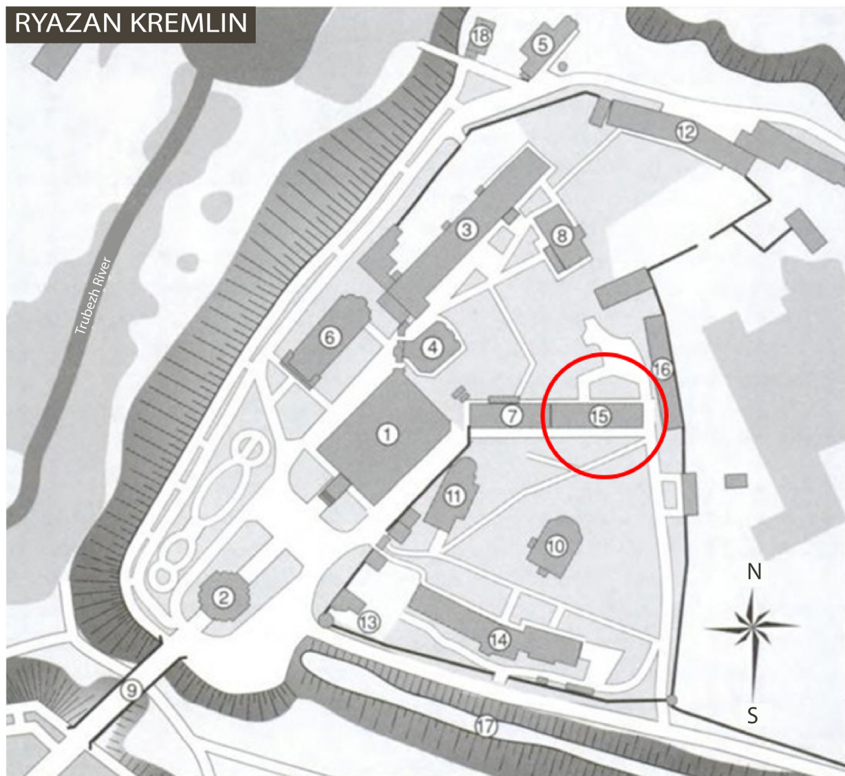
Figure 1. Buildings of the Ryazan Kremlin

Prior to the development of architecture-and-design solutions to adapt a part of the historical Household Building (late 17 th century, 19 th century) to modern use, as a cafe, a scientific research was performed. First and foremost, bibliographical and archival sources were studied. Then the