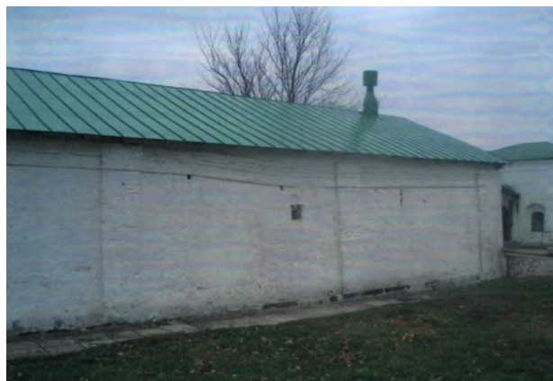
Figure 3. Facades of the building. Photos, 2010