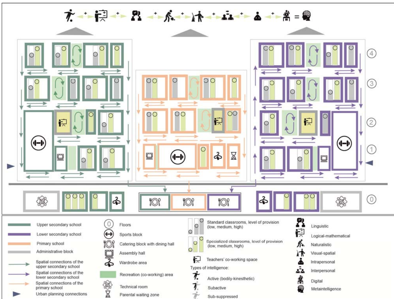
Fig. 3. Proposed architectural and planning model of the school (Astana)

concepts in practice. Additional spaces such as logic corners, robotics and programming laboratories, and mathematical project rooms can complement these core areas. According to the theory, the development of linguistic intelligence requires not only specific criteria but also specialized types of spaces that can stimulate this form of intelligence. Examples include language classrooms, literary corners, creative writing studios, spaces for linguistic games and problem-solving, literary discussion clubs, and recording studios. Bodily-kinesthetic intelligence is cultivated through physical activity, dance, games, coordination exercises, as well as practices of meditation and yoga. The corresponding spatial types include gyms, dance studios, interactive play zones, outdoor yoga and fitness areas, and studios for creative workshops. Naturalistic intelligence develops through experimentation and observation, as well as through the study of biology, geography, astronomy, chemistry, and physics, including field research, botany, and zoology. Specialized spaces such as astronomical observatories, zoological corners, winter gardens, and educational gardens play a key role in this process, as they immerse students in the natural environment