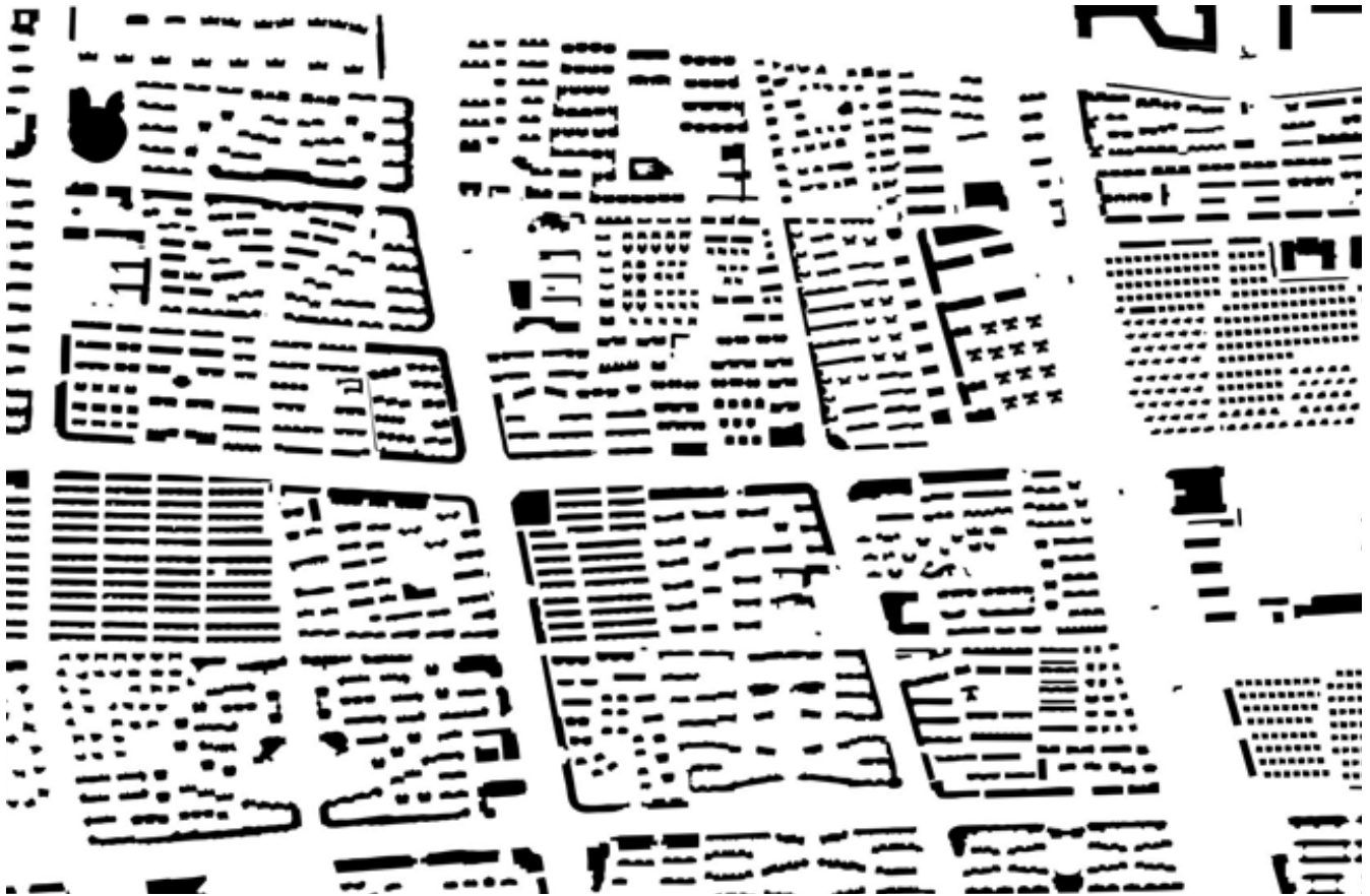
Figure 2. Guangzhou districts.

prototypes (patterns) allows reproducing the “genetic code” of an area.