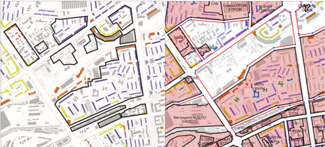
Figure 4. Identification of hypothetical locally coherent urban-planning formations created by the corresponding patterns, and their limitations.

application of such spatial patterns is a phenomenon of the modernist culture. This can be observed in works of students, when a complete but self-contained formation is implemented within the specified boundaries. Obtrusiveness of primitive patterns characterizes the modern development in Chinese residential areas (Figure 2). Thus, adaptation of patterns to an uneven urban structure without integrity loss can be considered the art of urban planning.