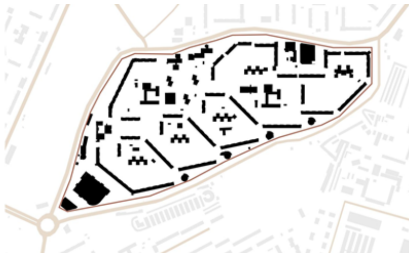
Figure 3. Repetition of residential groups in the Snegiri micro-district in Novosibirsk.

Integrity is related to another pattern property — limitation , i.e. territorial certainty. Patterns are localized within rigid boundaries as separate integral “portions”, forming the mosaic of the urban fabric. In their pure form, patterns manifest, for example, in the formation of micro-district structures disregarding the urban context. Direct